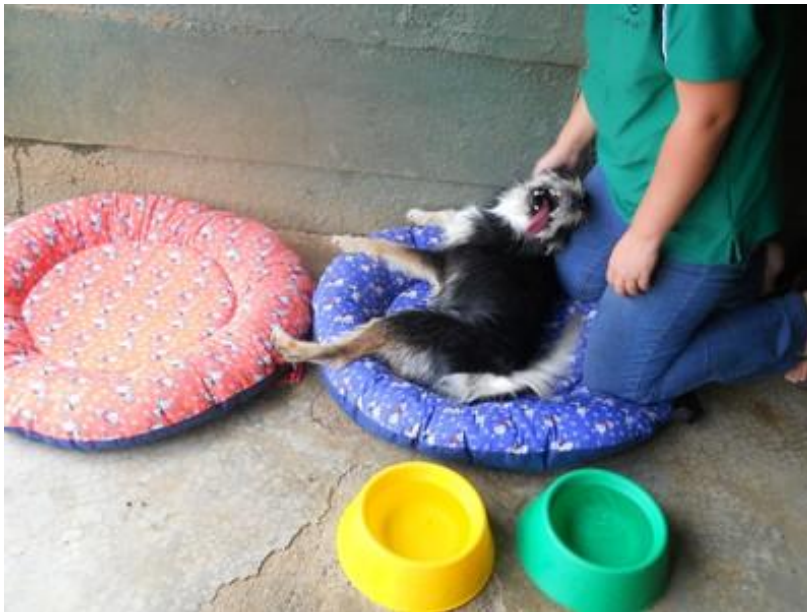
Snorre takes a break after all that excitement.