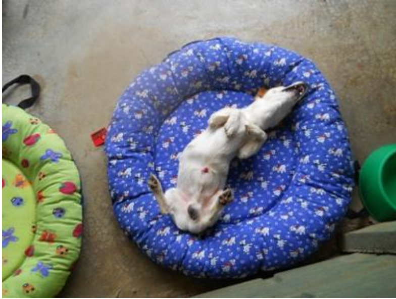
This is the life!