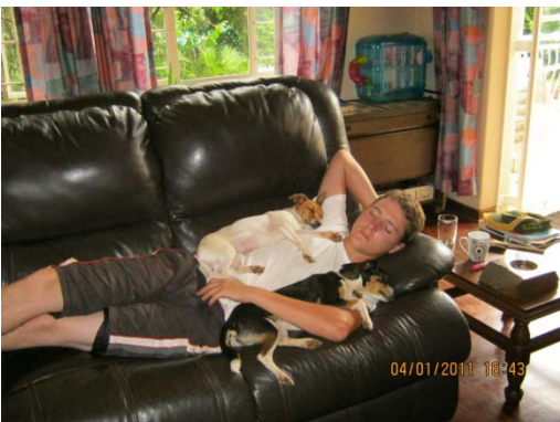
Meisie and Juby having a nap with their human brother...