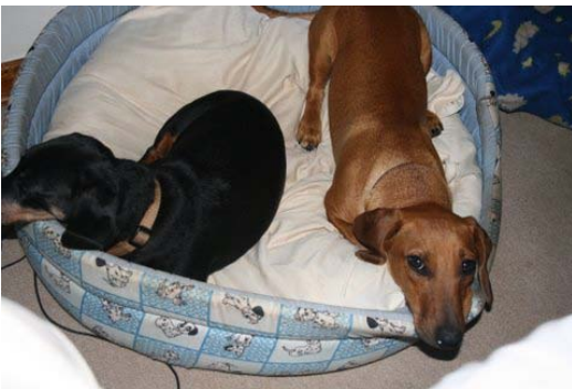
Charlie in his comfy bed at his new home.