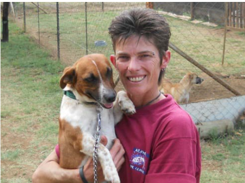
Michael with his new mommy – ooh, still a charmer!

Here are some photos of some of our adopted doggies from January that were kindly sent in by their new owners: